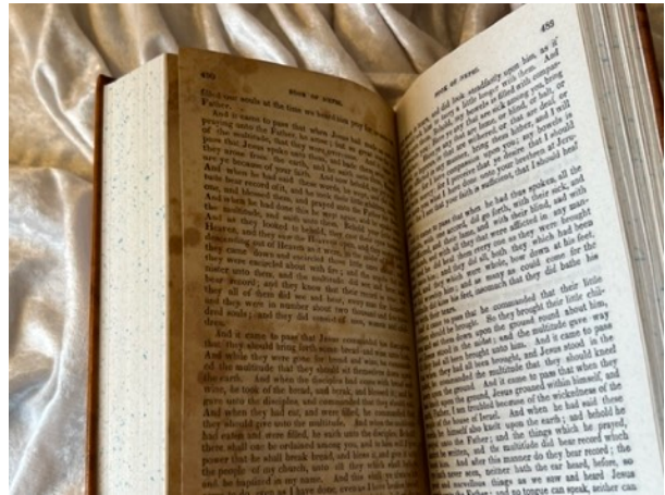
Book of Mormon Census