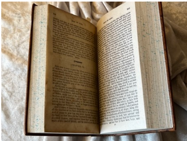
Book of Mormon Census