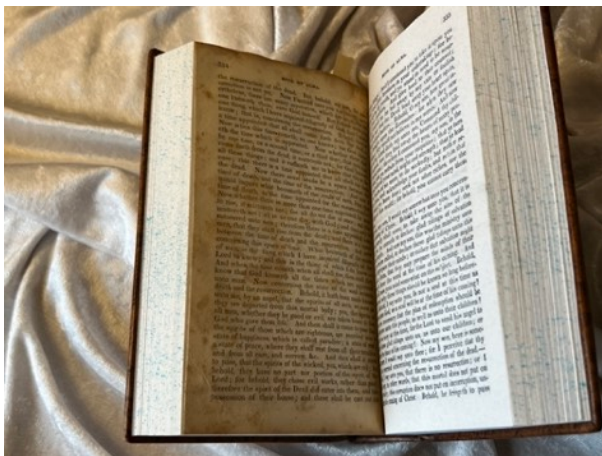
Book of Mormon Census