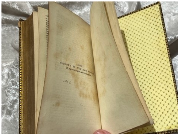
Book of Mormon Census