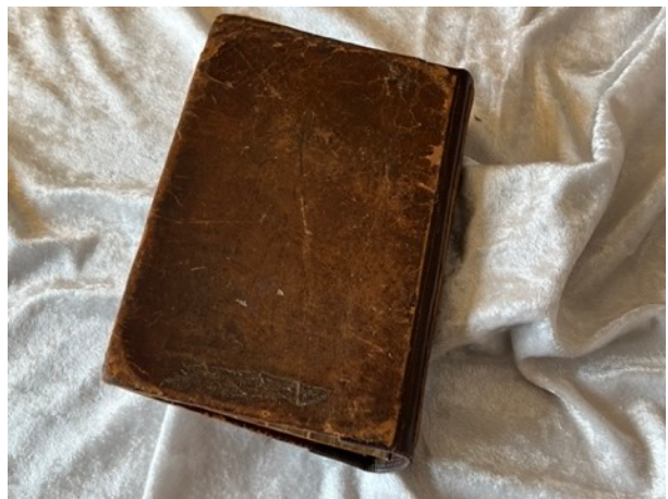
Book of Mormon Census