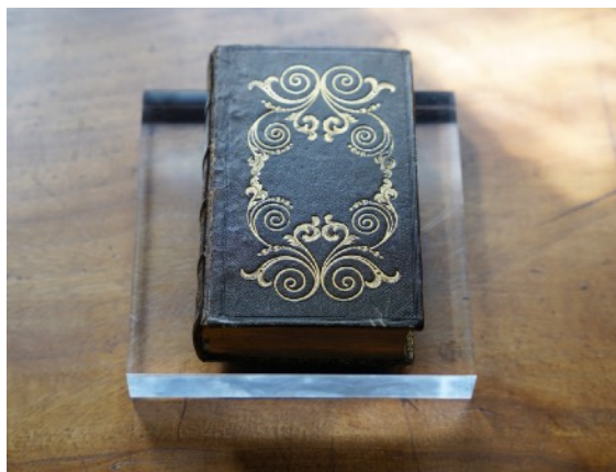
Book of Mormon Census

Pictures courtesy of Eva Koleva Timothy Photography, including: