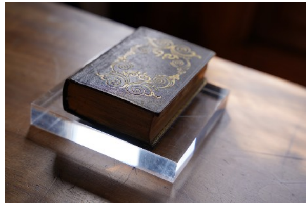
Book of Mormon Census