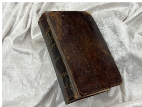
Book of Mormon Census