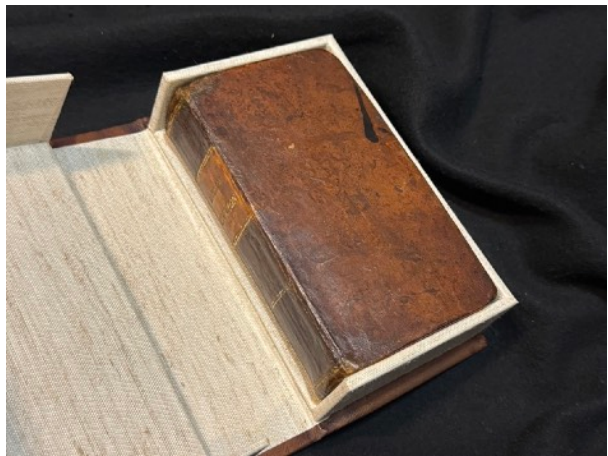
Book of Mormon Censur