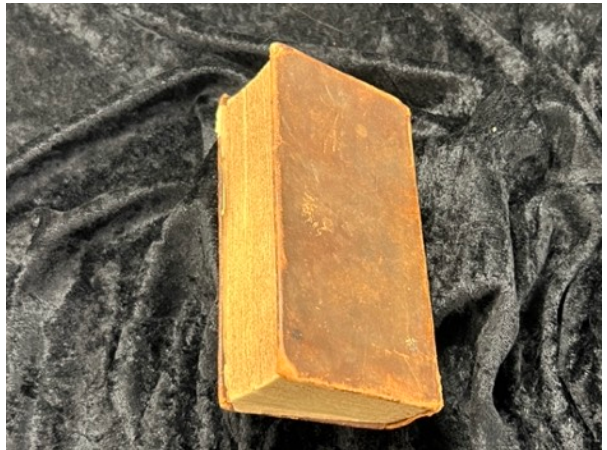
Book of Mormon Census