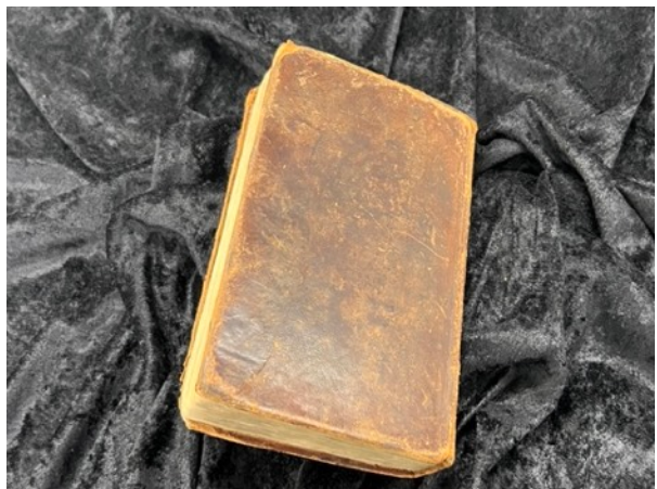
Book of Mormon Census