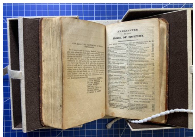
Book of Mormon Census