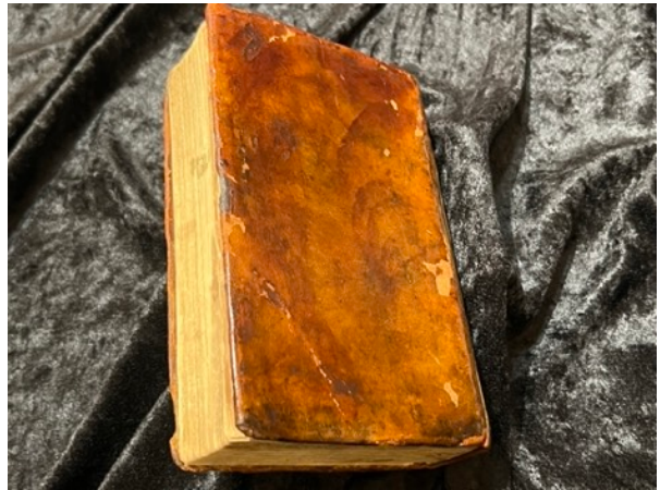
Book of Mormon Census