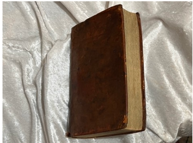
Book of Mormon Census